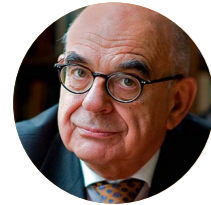
Professor Dr. Jan Pronk

degrees, with the welfare of the Afghan people. They believe that quality education is the engine for sustainable change and peace in Afghanistan.