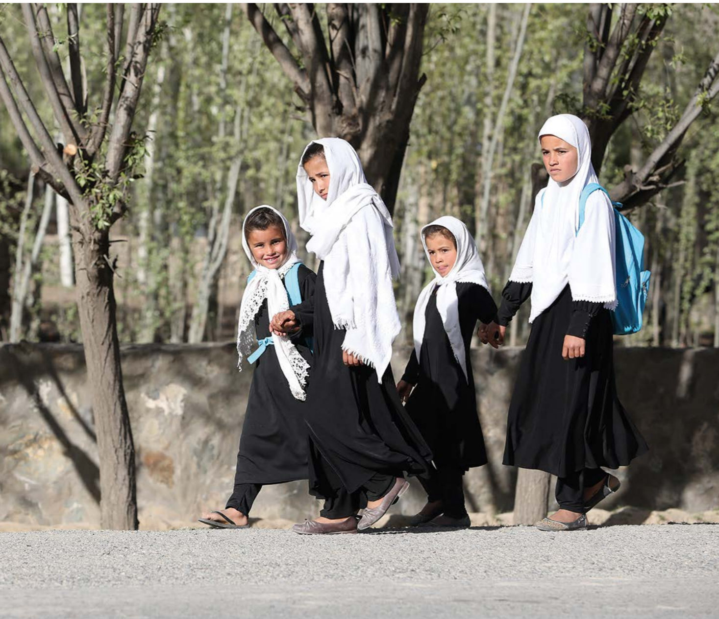
Girls on their way to school. 14

Nour believes in a humane, non-violent, and respectful approach