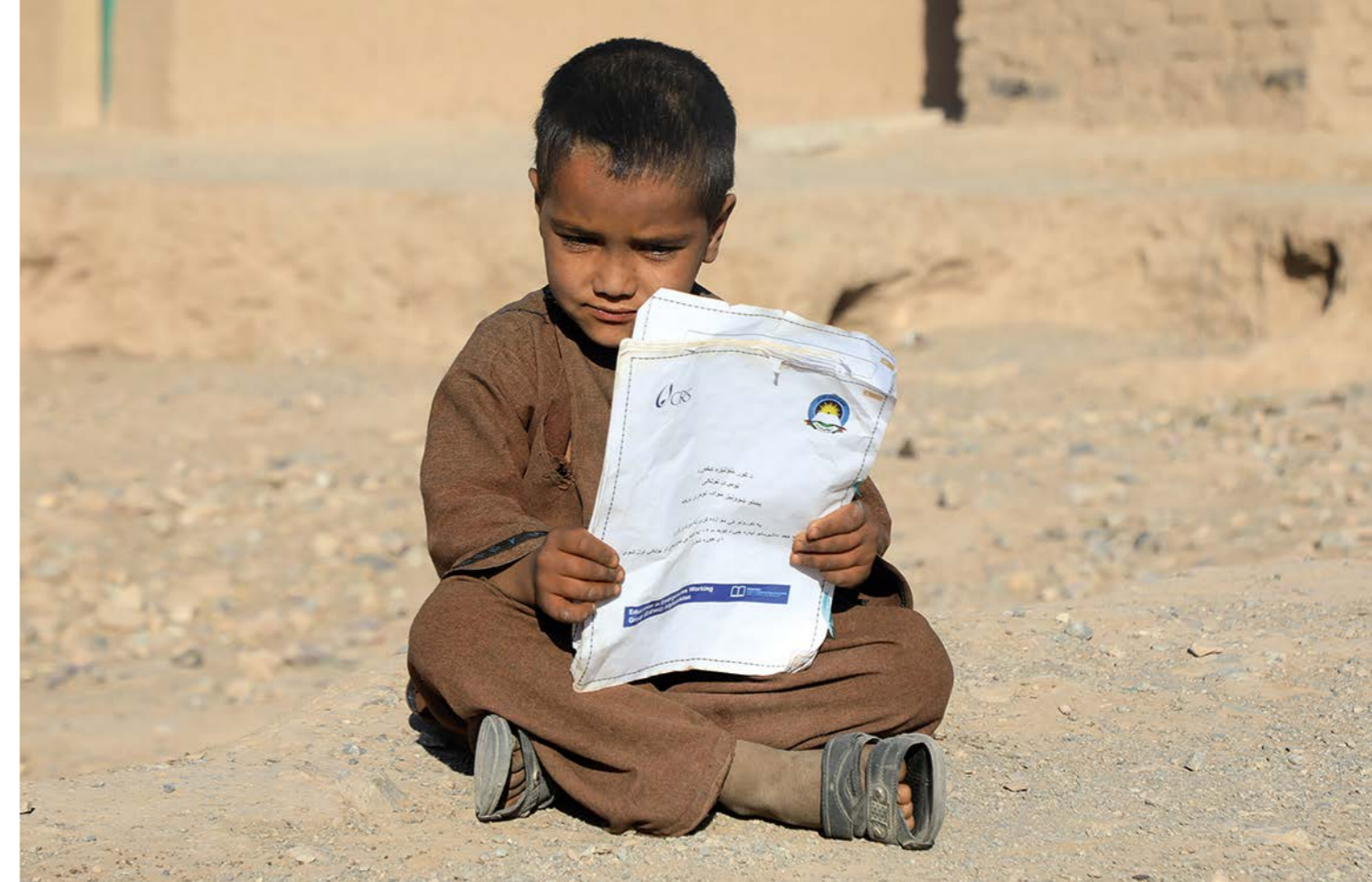
Every child has the right to develop. 13

Developing digital training programs for teachers focused on modern teaching techniques.