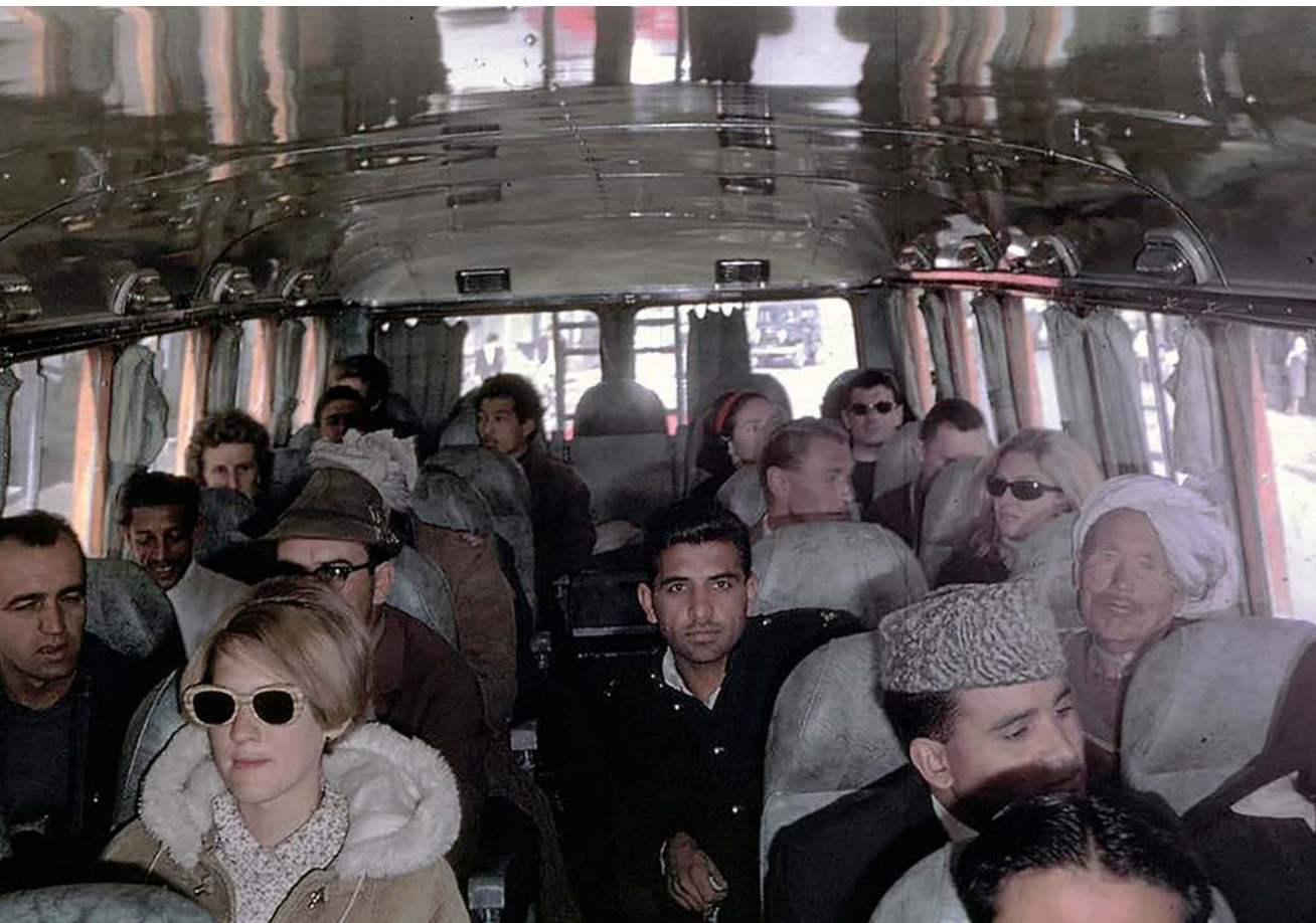
The 1960s. On the way from Kabul to Peshawar, Pakistan. 11

Nour promotes self-esteem, cultural preservation, and social cohesion through education