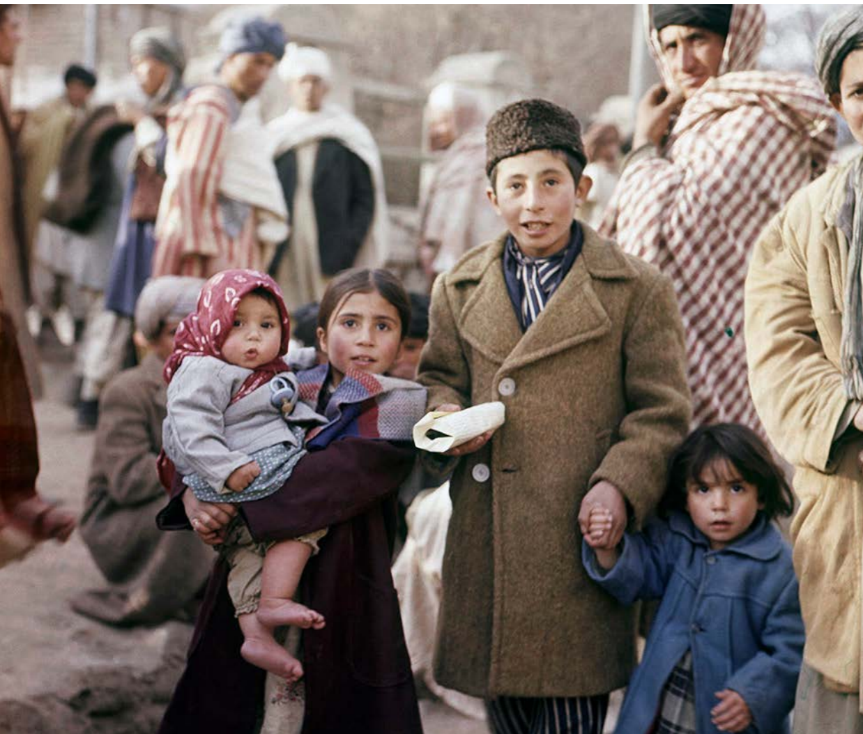
Children on the streets of Kabul, November 1961. 6

Nour offers an alternative path to peace