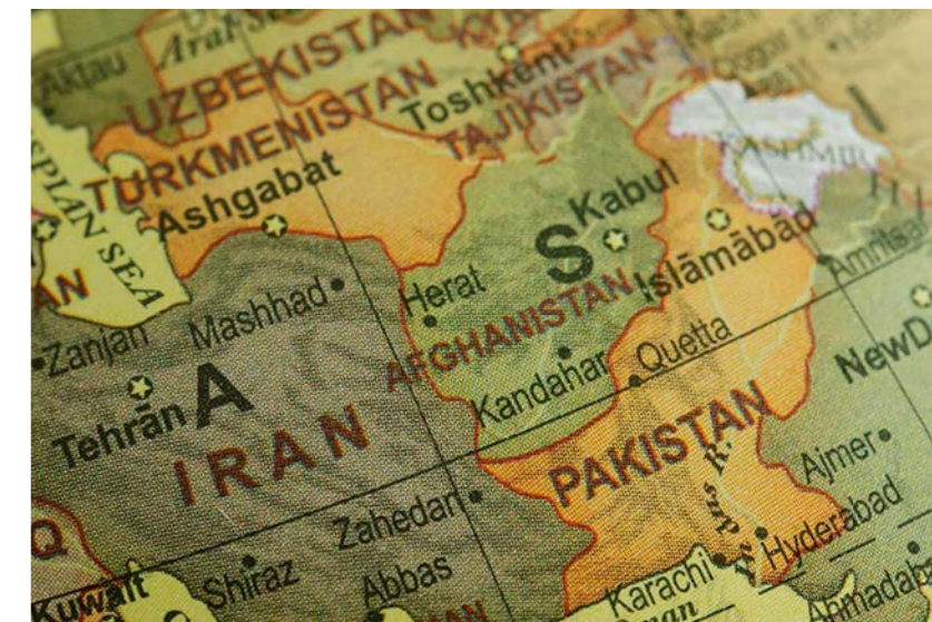
Afghanistan surrounded by its neighboring countries Iran, Pakistan, Turkmenistan, and Tajikistan. 12

A well-developed and secure digital learning space is crucial for the success of Nour's mission. Nour is developing its own Learning Management System (LMS) inspired by Canvas. Canvas is currently used as an LMS