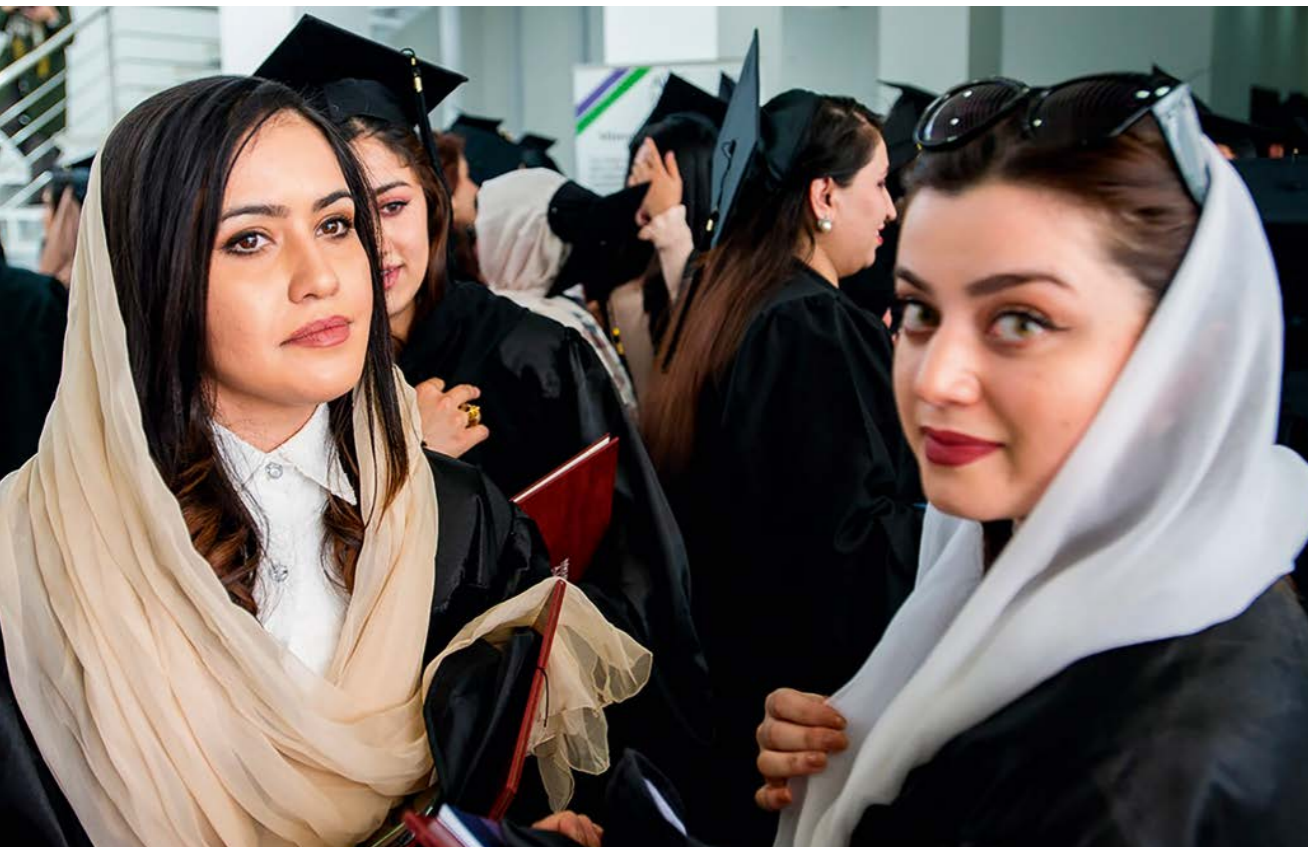
Students at the American University of Afghanistan at a time when the university was still physically accessible. 5

Education and learning: the key to a better future for Afghanistan